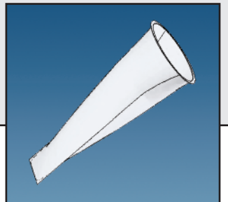
The filter media is tailored to fit inside every mouthpiece, providing an effective guard against crosscontamination.